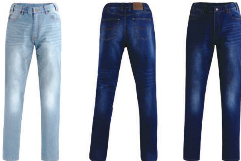
Acid Wash Denim