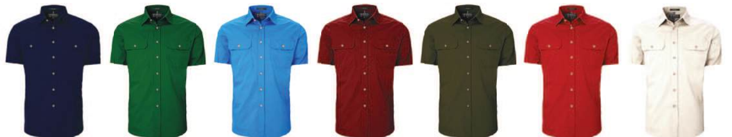
French-Navy Green Light-Blue Ochre Olive Red Stone