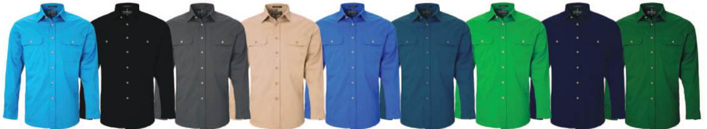
Azure Black Charcoal Clay Cobalt-Blue Diesel Emerald French-Navy Green