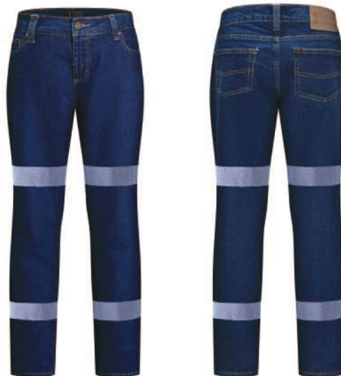
Stone Wash Blue Denim