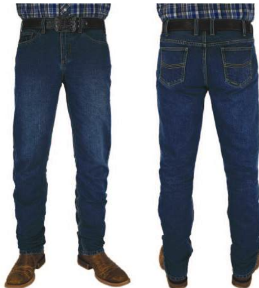
Brahman Slim Straight Leg – Indigo