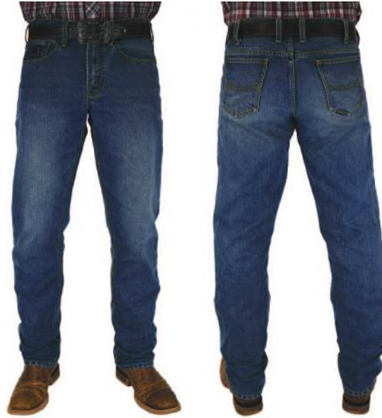
Angus Relaxed Straight Leg – Indigo