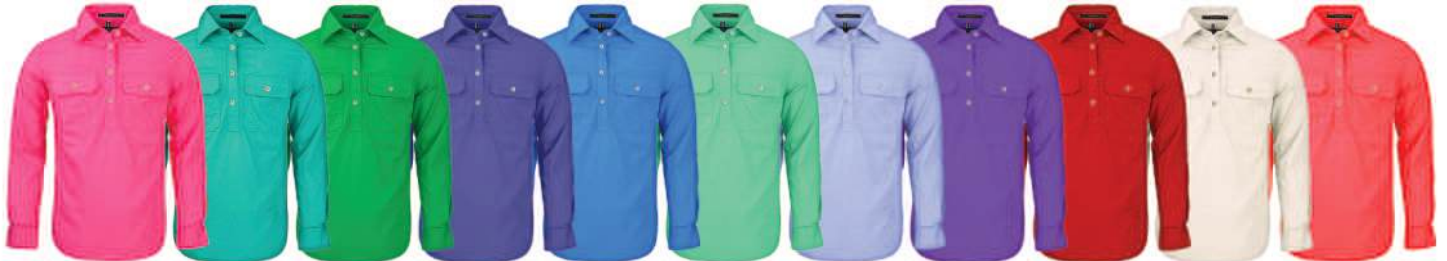
Hot-Pink Jade Kelly-Green Lavender Light-Blue Mint Pale-Blue Purple Red Stone Watermelon