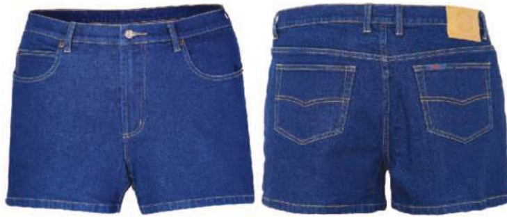
Stone Wash Blue Denim