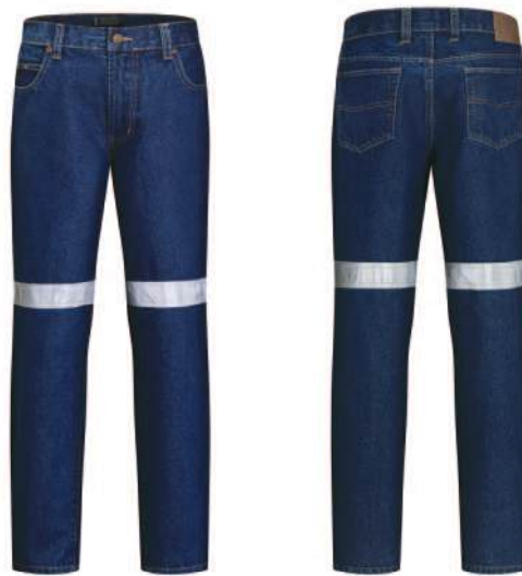
Stone Wash Blue Denim