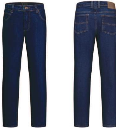
Stone Wash Blue Denim