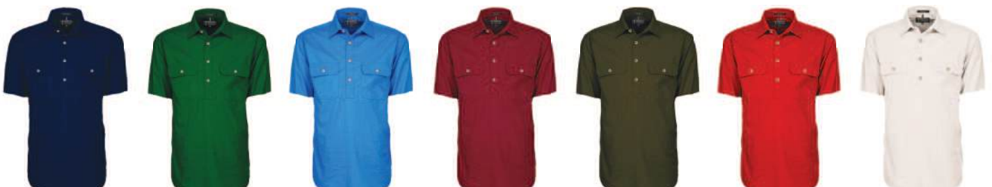
French-Navy Green Light-Blue Ochre Olive Red Stone