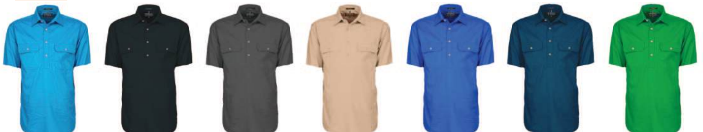
Azure Black Charcoal Clay Cobalt-Blue Diesel Emerald