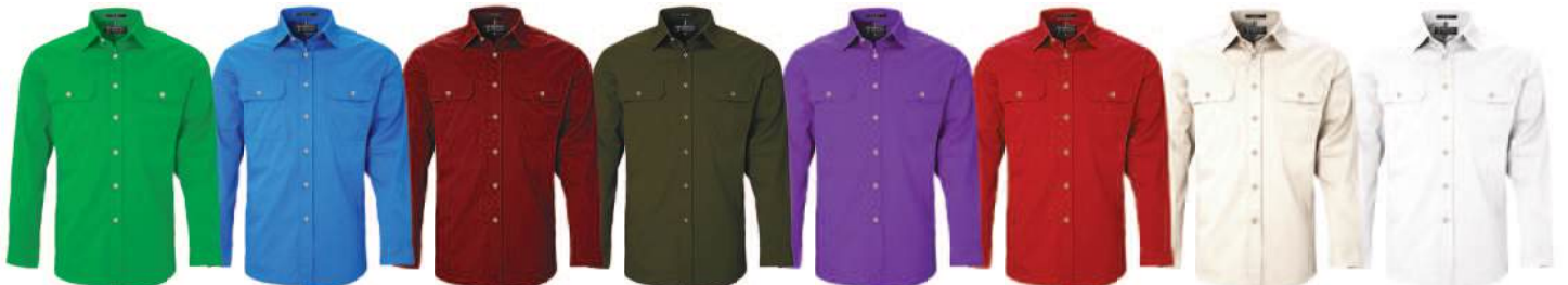
Kelly-Green Light-Blue Ochre Olive Purple Red Stone White