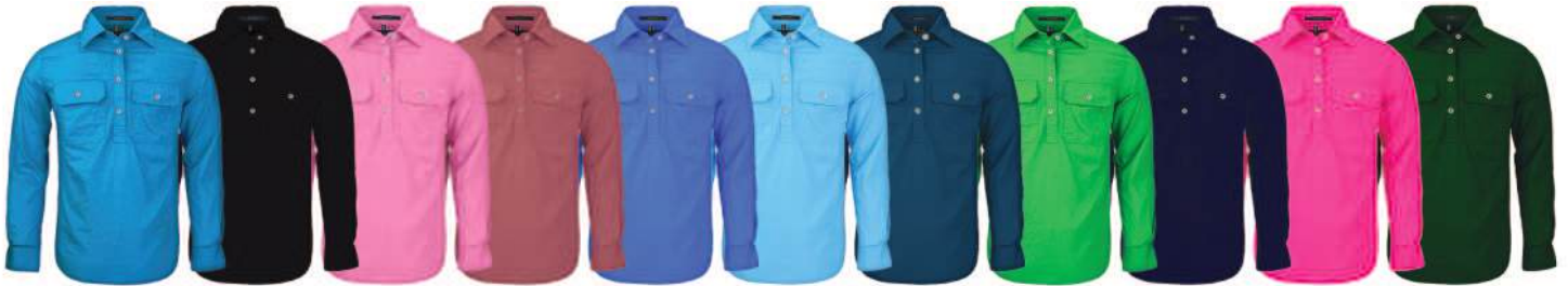
Azure Black Blush Canyon Cobalt-Blue Cornflower Diesel Emerald French-Navy Fuschia Green