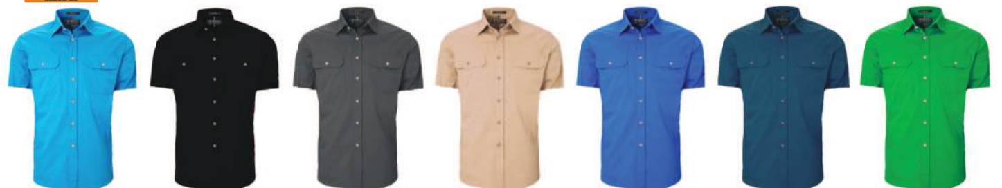
Azure Black Charcoal Clay Cobalt-Blue Diesel Emerald