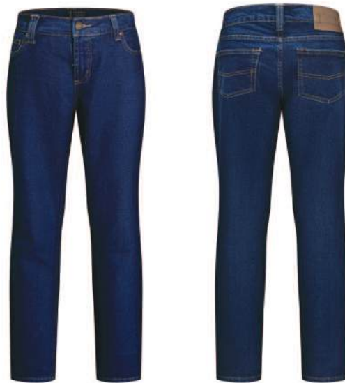
Stone Wash Blue Denim