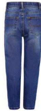
Weathered Blue Denim