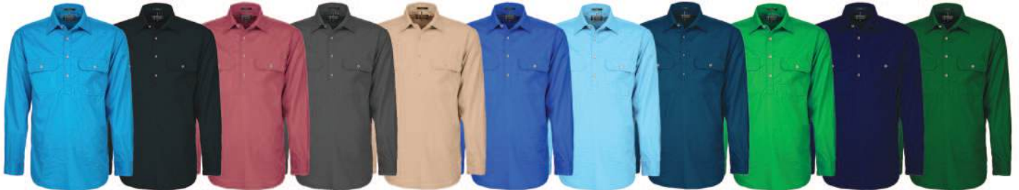
Azure Black Canyon Charcoal Clay Cobalt-Blue Cornflower Diesel Emerald French-Navy Green