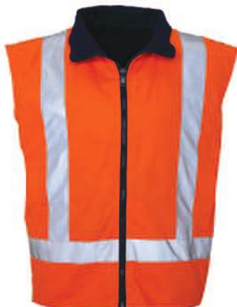
Orange & Reflective

*The UPF rating does not consider the design of this item in relation to recommended body coverage. Wear in combination with other sun protective clothing that has a UPF rating.