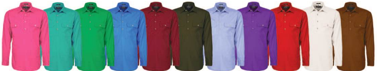
Hot-Pink Jade Kelly-Green Light-Blue Ochre Olive Pale-Blue Purple Red Stone Terracotta