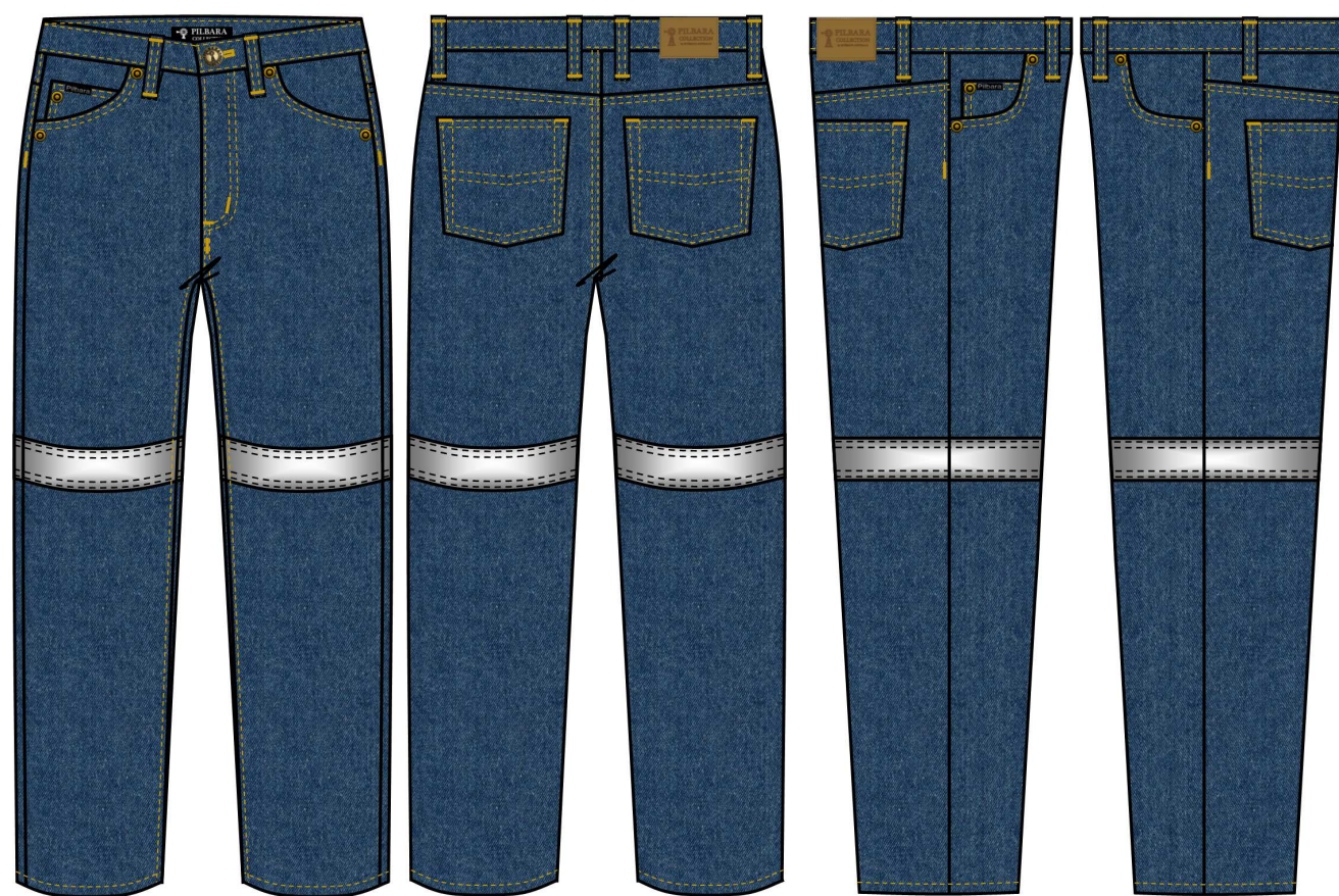
Stone Wash Denim Blue