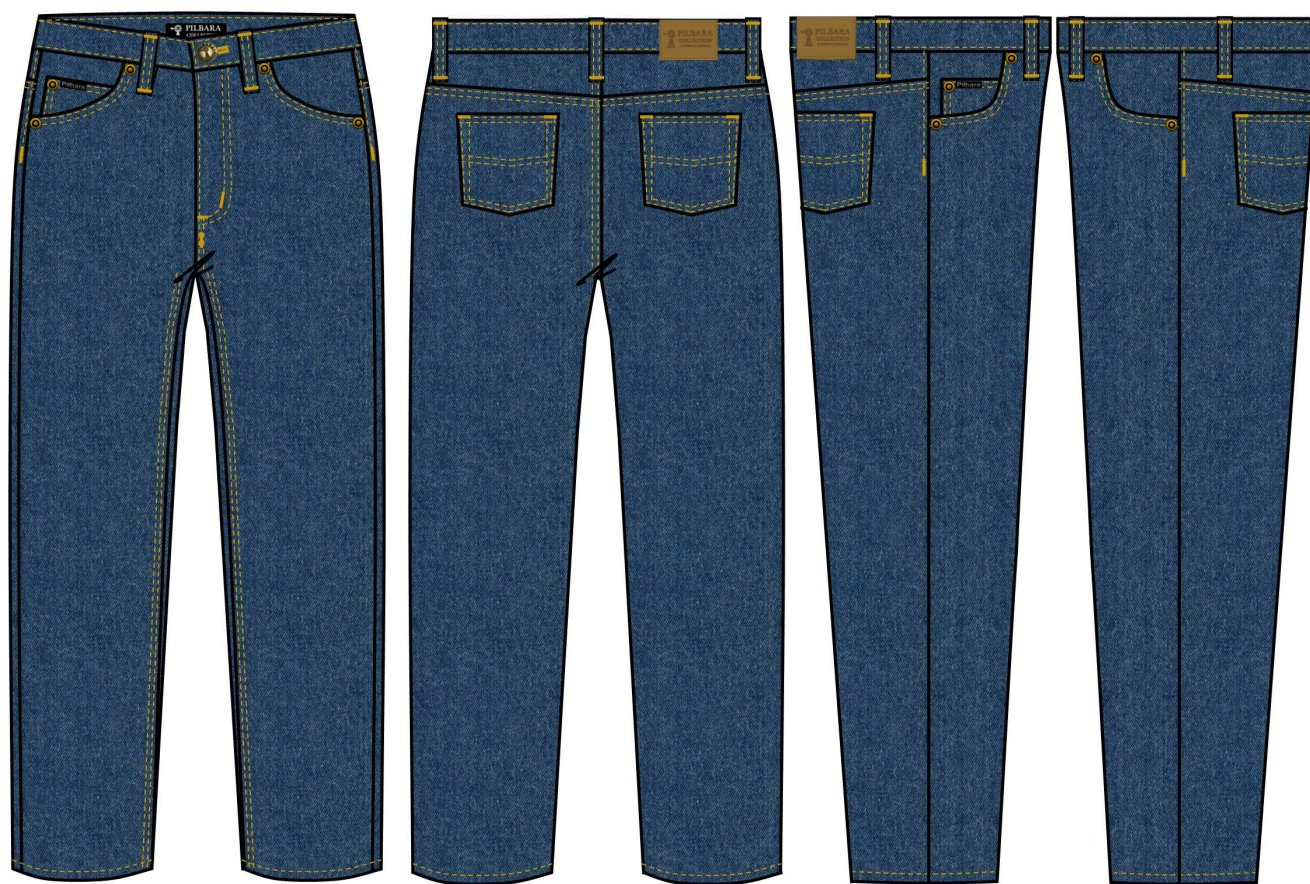
Stone Wash Denim Blue